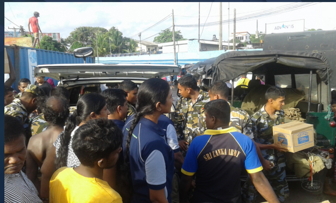
lunch packets to flood victims in 2016 at Kelaniya