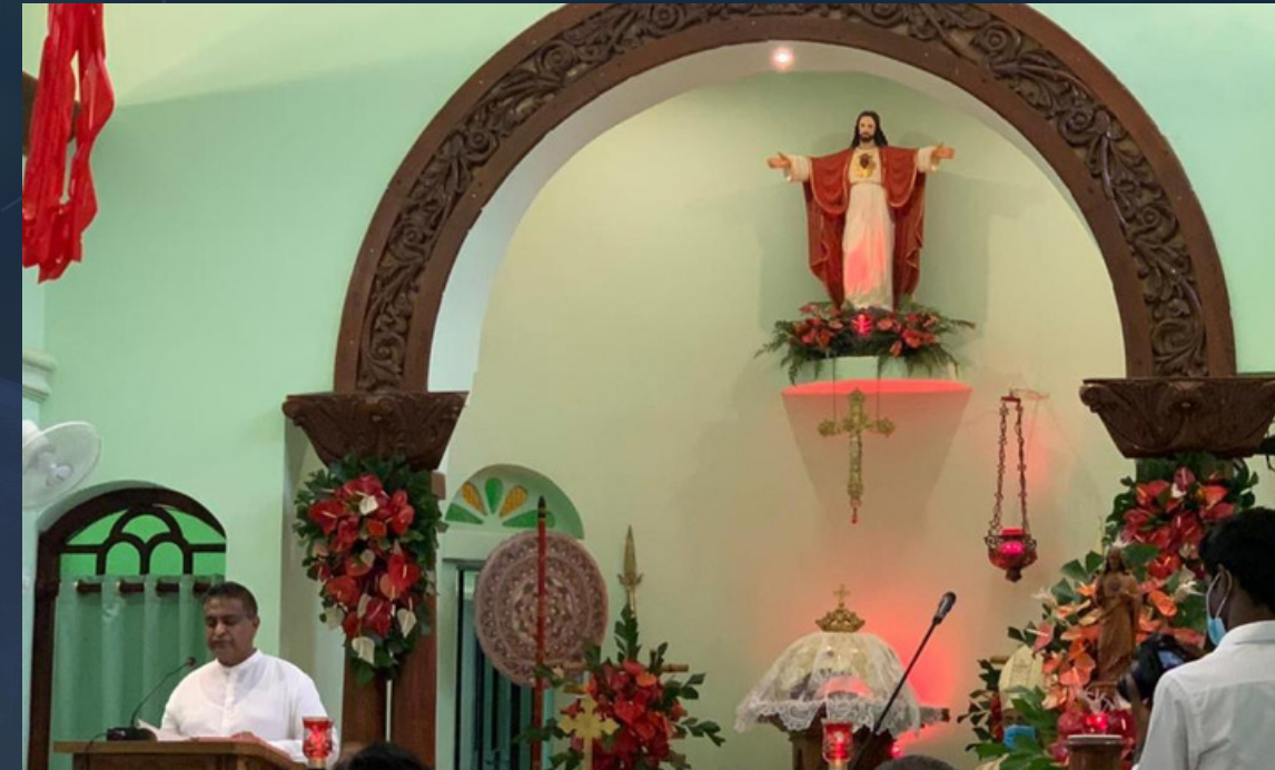
Light fittings to chapel at Daham Sevana Seminary