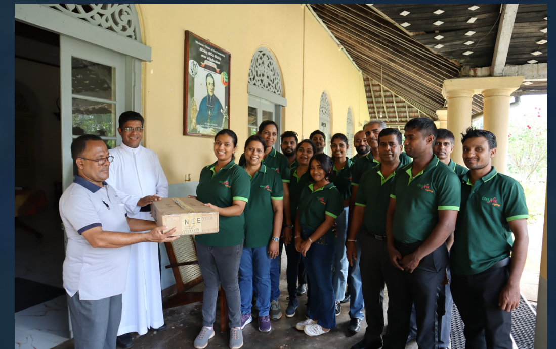
Light fittings to Calvary church Maggona