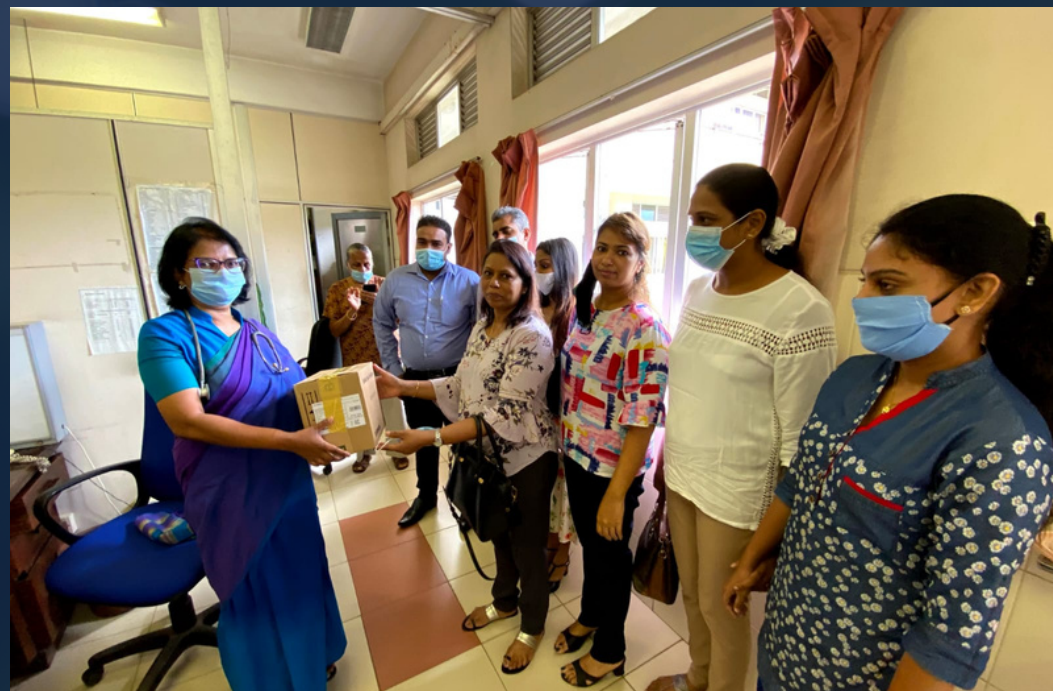
Medicine to Apeksha hospital Maharagama