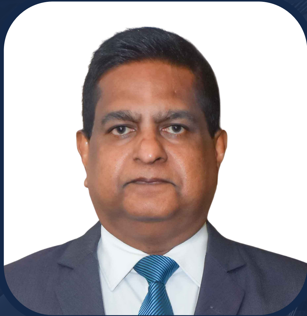
MD / CEO

GREENEE LIGHTING has been in the industry for more than 12 years growing from strength to strengths with innovative and sustainable lighting solutions. We at GREENEE LIGHTING are committed to give you an unforgettable Lighting experience in your space. We are a total Lighting Solution provider from Concept to Completion. Our solutions be it customized or otherwise cater to Architectural, Commercial, Industrial and Residential.