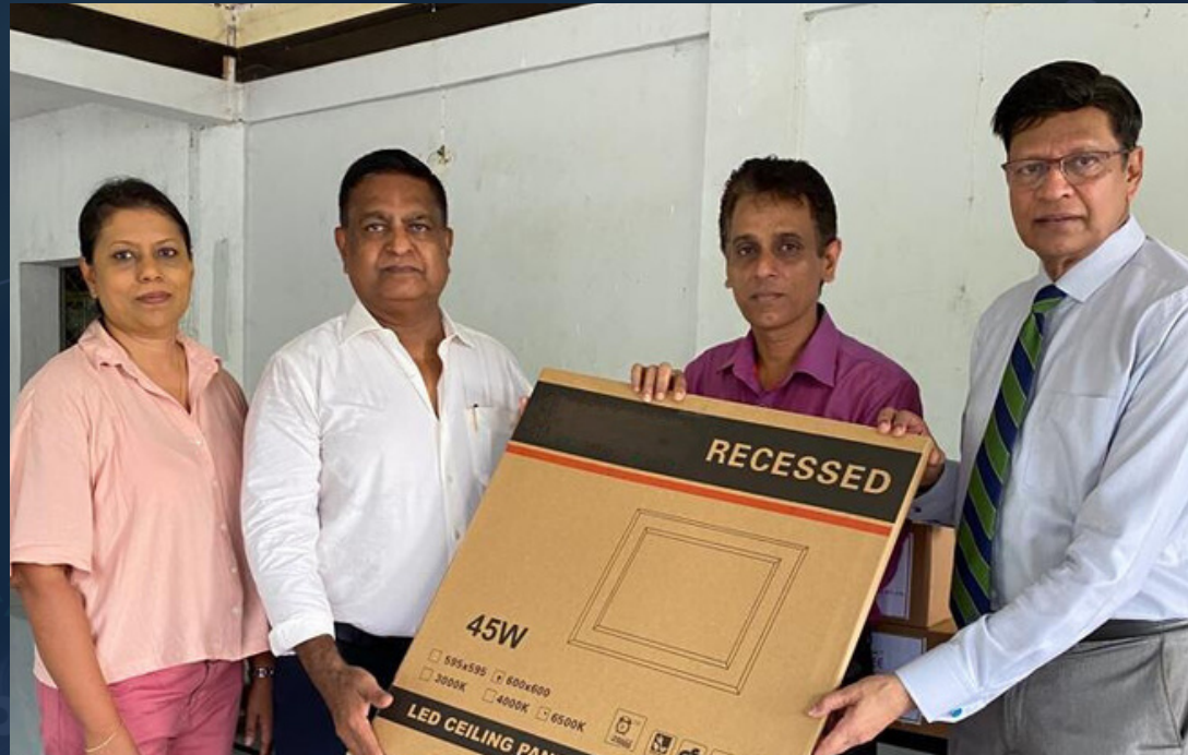
Light fittings to Vocational Training Center Hekitta